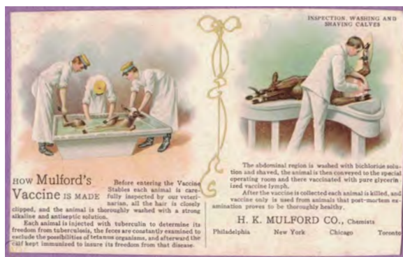
Animals being inspected and prepared to be injected with tuberculin.

Below are two postcards the H.K. Mulford Co. published in a series of 8 cards with illustrations and text showing the complete methods of Vaccine Production.