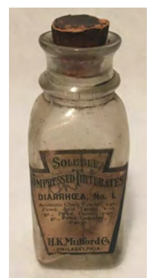
Antique Bottle of one of Mulford's many medication products.

"The Mulford Biological Laboratories are situated in Glenolden, Pennsylvania, nine miles south of Philadelphia, on the highway to Baltimore and Washington.