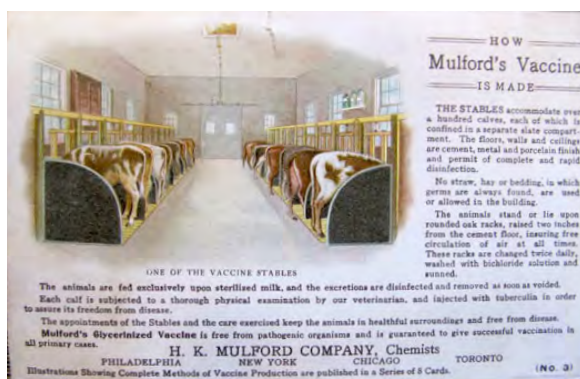
Calves confined in their separate stalls and fed exclusively with sterilized milk to assure freedom from infection.

In 1953, Sharpe & Dohme merged with Merck & Co. to form Merck, Sharpe & Dohme. By 1957 the merged company had sold off most of its holdings in Glenolden.