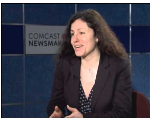
At left: Comcast file photo; Above: Photo by Ann Jackson

Board members and volunteers of DCVA will display posters about other activities in the watershed including most notably our annual watershed clean-up. It is our banner event and pulls in hundreds of volunteers every year. We can always use more help, so please consider volunteering your time in April to help clean up the watershed. Lastly, our annual meeting is free to our members and includes lunch. Come out to network, learn about new ways to volunteer, and hear about our latest activities. We love to see members out at our events, and it provides us an opportunity to learn more about your interests and ways we can help you to get involved.