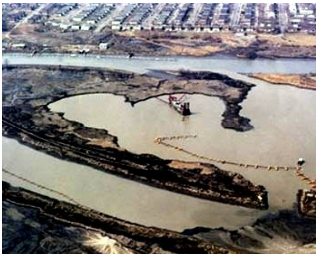
Lagoon Dredging

The Setting - The lands and waters that now comprise the John Heinz National Wildlife Refuge at Tinicum are set in a highly industrialized corridor at the foot of the Darby Creek watershed. Approximately \frac{1}{4} of the refuge lands lie within the boundaries of the City of Philadelphia and are known today as the "refuge impoundment". The remaining \frac{3}{4} of the refuge's acreage lie in Delaware County and contain the bulk of the refuge's tidal marshes. In the early 50's, the area was surrounded or impacted by an ever expanding international airport, three sewage treatment plants, a tank farm, a smoke belching, water polluting incinerator, high density residential development, and crisscrossed by several oil and gas pipelines. Then in the mid to late 60's two highly unsanitary landfills and international highway development were added to the mix. This was an unlikely spot in which to found a national wildlife refuge!