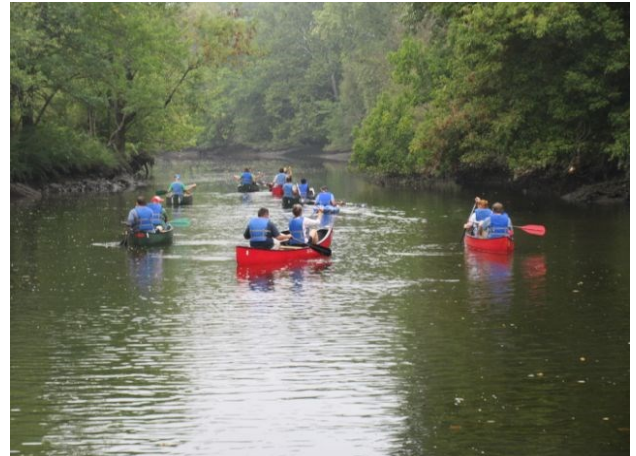
They're Off! DCVA Canoe Ramble, September 2015

Posters, Presentations, Conversation & Lunch provided