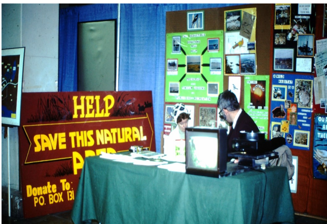
CARP presentations generated support for marsh preservation.

At this point in time Department of Interior Secretary, Walter Hickel, was invited to view the area and hopefully broker a solution between the warring factions. He met with Delaware County politicians who assured him that they supported the highway construction with its attendant dredging and filling operations, as well as future industrial development of the area, and would not change their minds. Then Secretary Hickel met with preservationists and advised them that in light of the political atmosphere, if they wanted a chance to win they would have to form a grass roots organization.