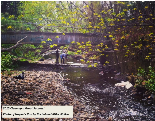
2015 Clean up a Great Success!

The 2016 annual cleanup event will take place on Saturday April 23rd rain or shine. This will be our 32nd year of continuous operation carried out entirely by our dedicated volunteers. Last year we had 650 folks who unselfishly helped clean litter and other debris from Darby Creek, Cobbs Creek, Naylor's Run, and other tributaries