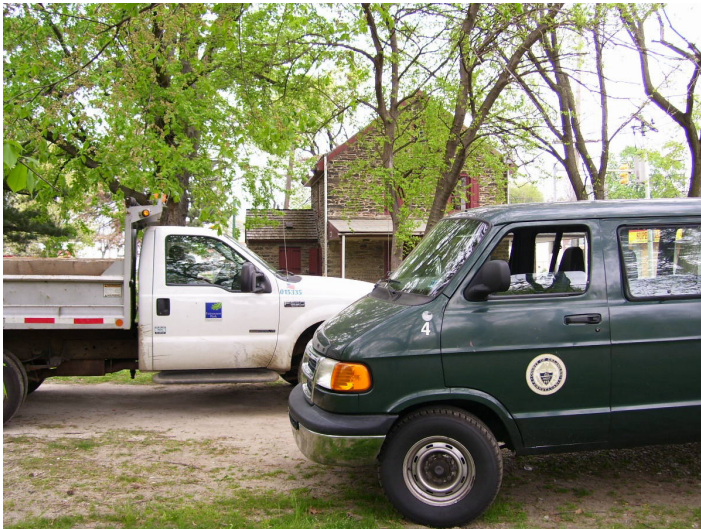
On the day of the Cleanup, with the historic Blue Bell Inn in the background, a Delaware County truck and a Fairmount Park truck show intercounty cooperation during this year's cleanup of the Darby Creek.