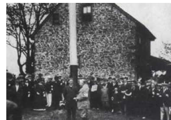
Original Clubhouse Circa 1919 McCall Golf and Country Club, 201 N. Lynn Blvd. Highland Park, PA 19083

"It was 1912 when McCall Field was purchased for baseball team competition among companies that would one day become PECO Energy. The site quickly became a popular location for track, soccer, tennis and family picnics. Originally an old farm complete with rolling corn fields, house and barn, the land eventually emerged into the conference center and recreation complex it is today with 77 acres for golf, baseball, football, tennis, volleyball, corporate meeting and social events.