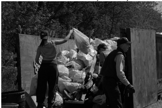
The last of the trash from Heinz Refuge at Route 420