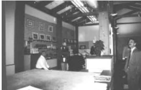
At the Cusano Environmental Education Center Preview Event on December 14, 2000, a guest looks over the Friends of Heinz Wildlife Refuge Gift Shop, "Tincum Treasures," in the new center.

After years of anticipation, the Cusano Environmental Education Center at the Heinz Refuge will open to the public January 20 th . About 200 invited guests were able to preview the Center on December 14 th . They saw a 14,000 square foot facility featuring classrooms with wetlabs, a resource library, a multipurpose meeting room with a full complement of audiovisual equipment, an exhibit and display area with a "cross section of Tincum Marsh" diorama and a gift shop which is operated by the refuge's Friends Group.