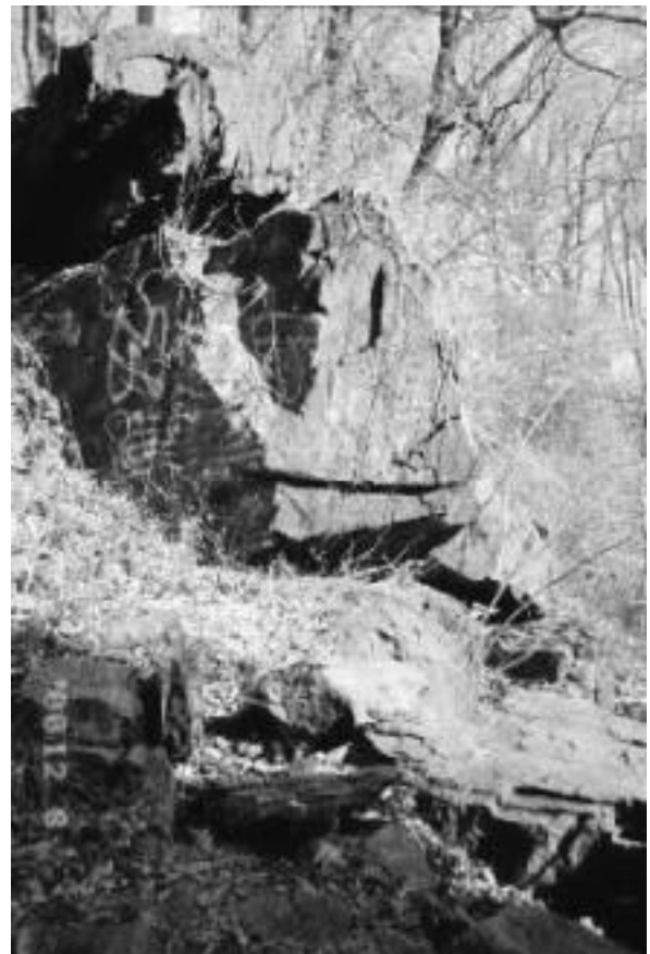
Indian Head Rock—one of the sites along the proposed Darby Creek Stream Park.

Some years back, Delaware County developed a plan for a Darby Creek Stream Park, to extend from the Swedish Cabin to Darby Borough. For a number of reasons the plan was never implemented. DCVA is now seeking Growing Greener funds to resurrect the plan and extend the Park upstream, encompassing the area described above.