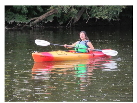
The Governor Printz Canoe Challenge First Ever Dusk Paddle September 9, 2016