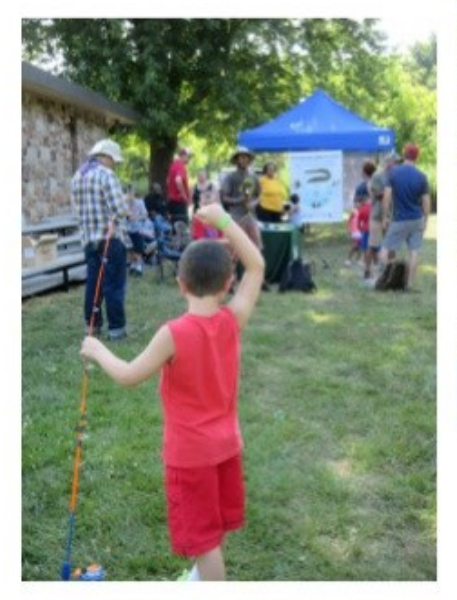
Learning to cast at Family Fishing Day JHNWR.