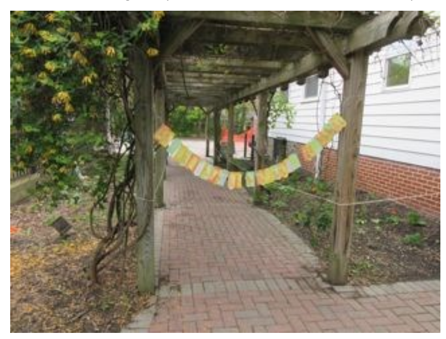
Garden " 1 Partial shade garden

<u>"Garden#2</u> features Pennsylvania sedges as an alternative to turf lawn and bunch grasses. Sedges look like grasses but the stems are triangular in cross section rather than round. Native sedges provide habitat for several species of butterflies including the brown-eyed butterfly and the broad winged Skipper. The chestnut sided warbler searches the sedges for insects, including caterpillars that are attracted to the to these plants.