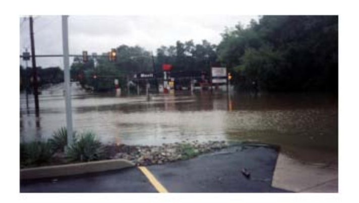
Flooding in the Lower Watershed