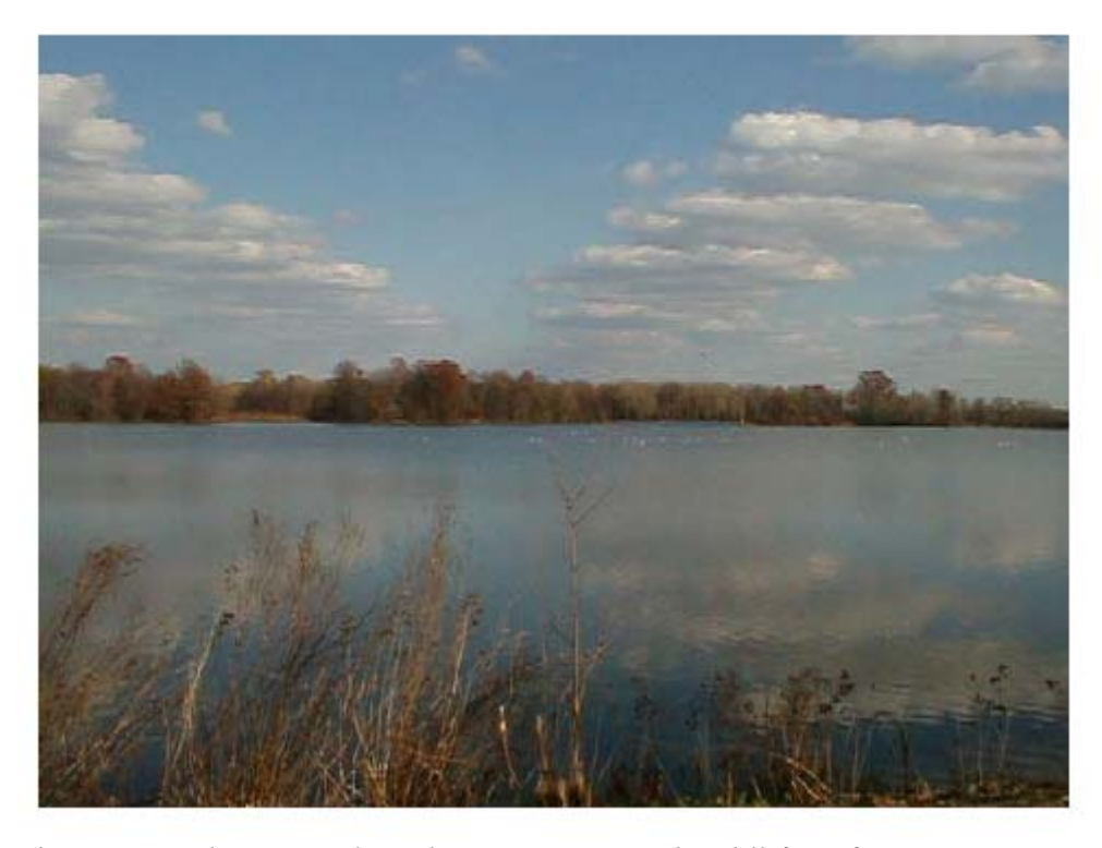
The "Impoundment" at the John Heinz National Wildlife Refuge at Tinicum

Wetlands act as natural filters, cleaning stormwater runoff, protecting our streams, and mitigating against flooding. Natural floodplains (i.e., the land adjoining the streams) have too often been paved over in many places, destroying their ability to serve as natural buffers. Through years of development in the Watershed, buildings and other improvements were too often constructed in a manner that was unnecessarily damaging to these natural buffers. As a result, sediment from disturbed areas upstream has been transported downstream by increased stormwater runoff. The overall urbanization of the Watershed, and perhaps more importantly, the specific nature of development on particular sites, has increased the volume and velocity of runoff. Contaminants deposited on streets and paved areas, such as oil, gasoline, metals, and other substances are often washed away to be deposited in the stream system.