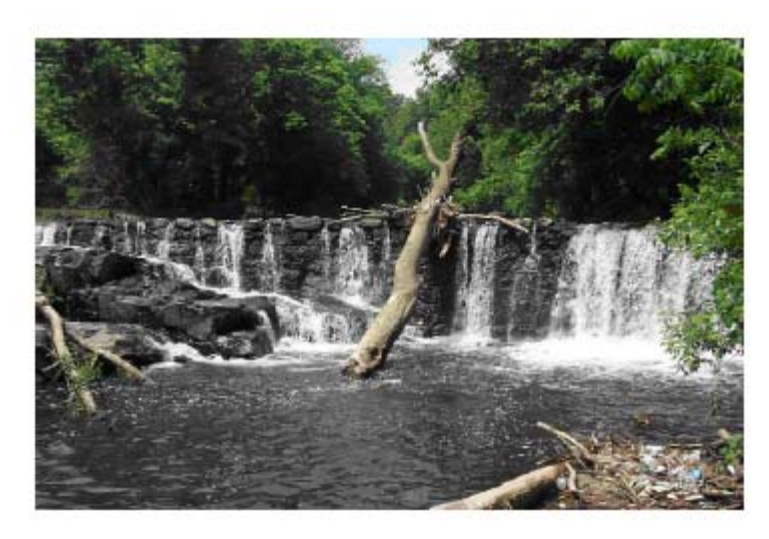
Waterfall in Proposed Upper Darby Area Greenway