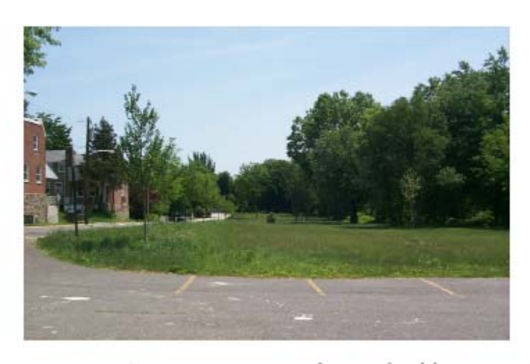
WRAP Grant Project Area in Darby Borough (Houses Removed)