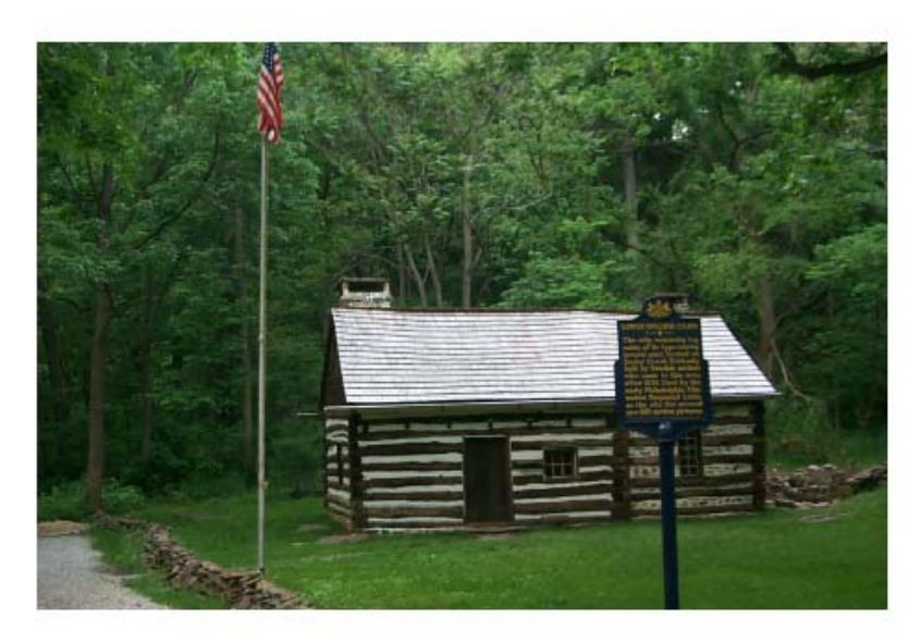
Historic Swedish Cabin Along Darby Creek (Upper Darby Township)

To join, contact the DCVA at P.O. Box 732, Drexel Hill, PA 19026.