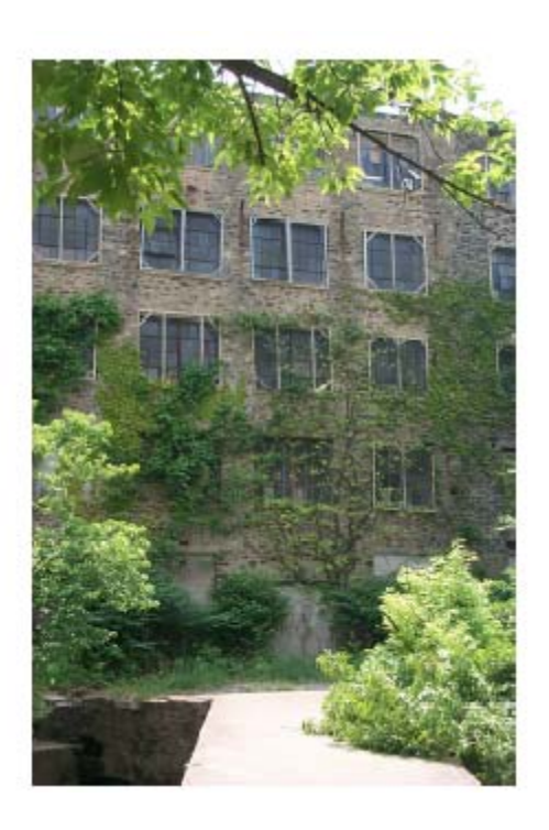
Historic Kent Mill Structure in the Proposed Upper Darby Area Greenway

There are many existing programs of governmental and quasi-governmental agencies designed to improve the quality of the Watershed. Many of these programs are focused on specific aspects of the Watershed. No one agency or authority has jurisdiction over all Watershed matters. The following paragraphs briefly outline a number of these ongoing programs: